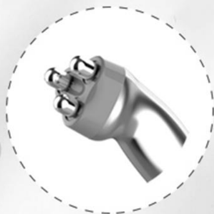
Three polar RF