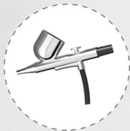
Oxygen spray gun