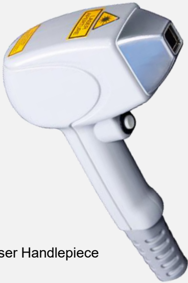
Diode Laser Handlepiece